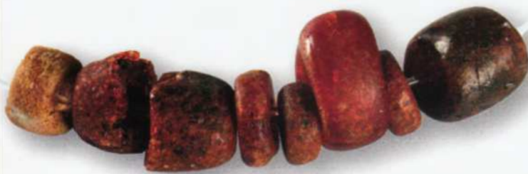
Late Bronze Age amber beads (1,500 – 600 BC)