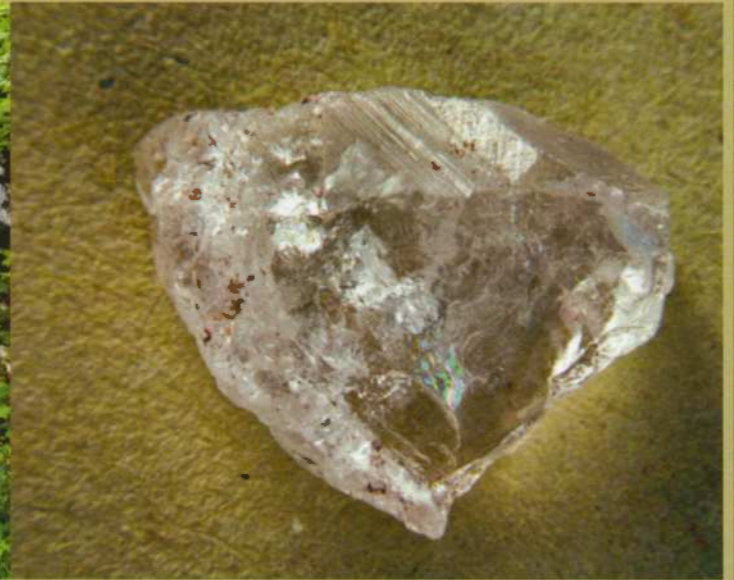
Quartz crystal (exact date uncertain). Photo by Thorsten Kahlert