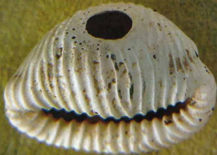
Cowrie shell beads (1,500 – 600 BC).