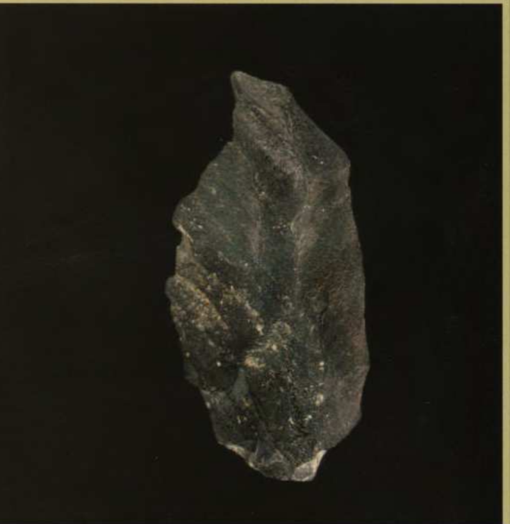
Neolithic chert blade (4,000 - 2,400 BC).