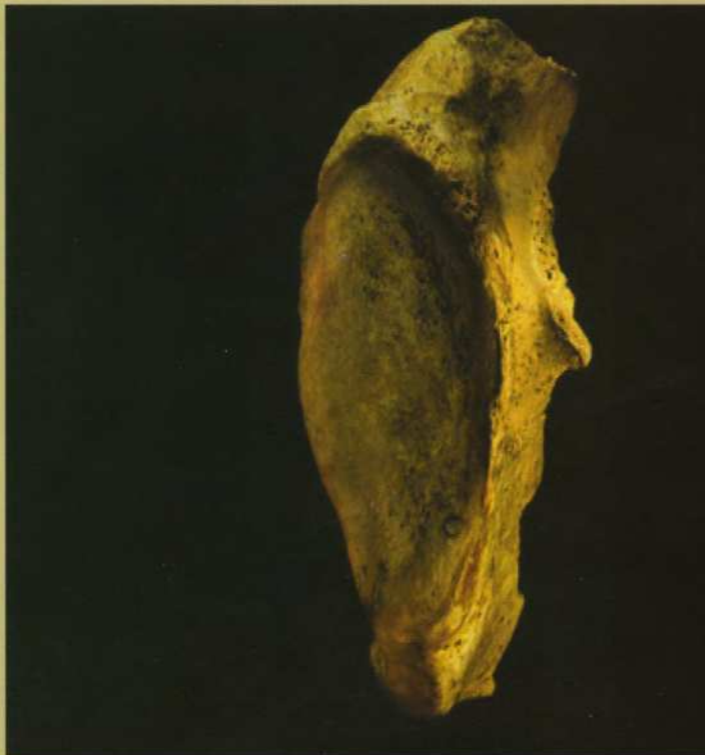
Bear scapula (shoulder bone) – Early Mesolithic.