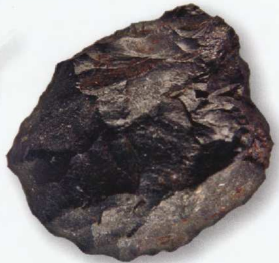
Bronze Age chert scraper, may have been used for cleaning animal hides, basketry or bone working (2,400 – 1,400 BC)