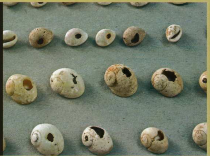
Periwinkle and cowrie shell beads (1,500 – 600 BC).