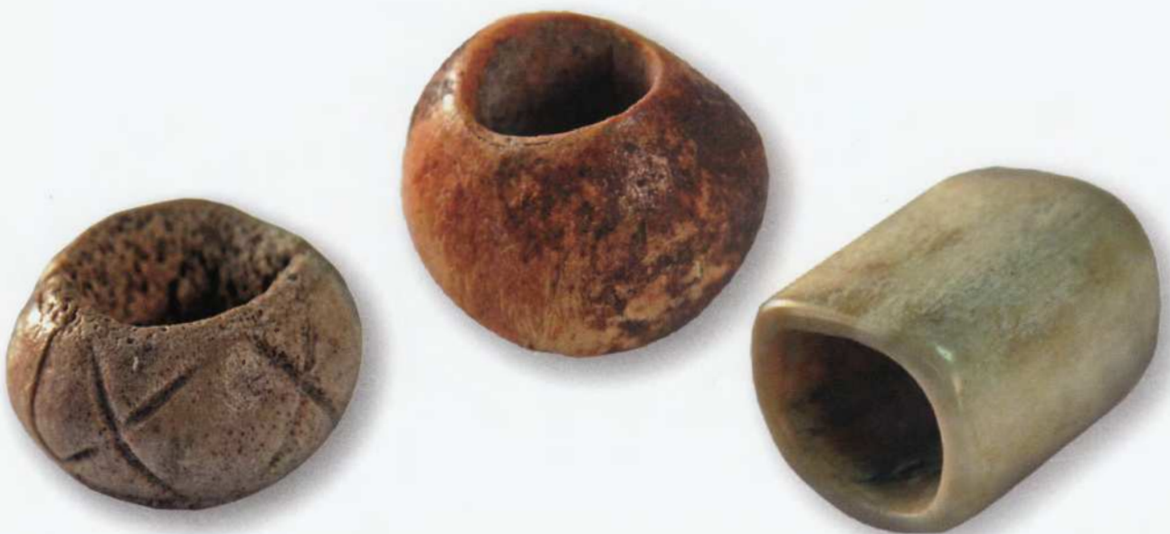
Prehistoric bone beads (exact date uncertain)