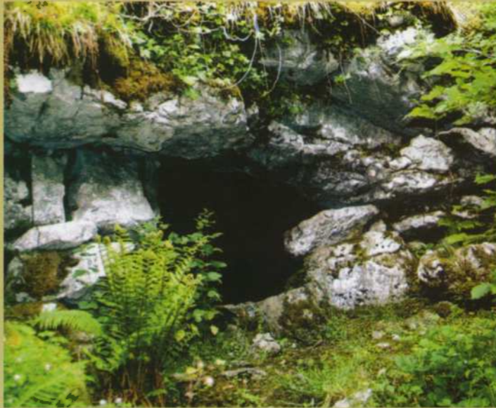
Glencurran Cave.