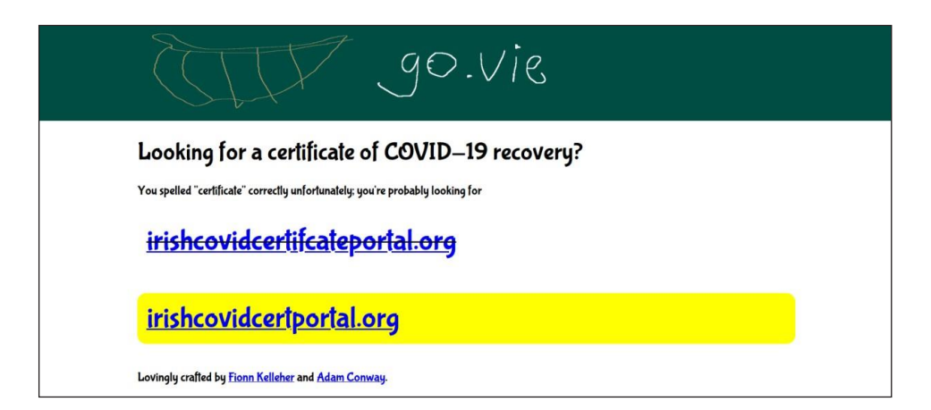
Fig. 2. Screenshot of a website created by two Twitter users redirecting users to the correct government URL with its incorrect spelling, following the incorrect spelling of 'certificate'

Four days after the launch of the certificate the government launched a website for residents who had acquired immunity through previous infection to request certification (Government of Ireland, 2021c). This was set up to reduce pressure on the phone lines, following complaints. However, this website too was beset with issues. The URL for the website contained a typo and was listed as irishcovidcertifcateportal.org, missing an 'i' in the word certificate. The error was quickly spotted by citizens, who set up a replica site redirecting users to the correct URL to avoid potential fraud (Cosgrave & Wilson, 2021) (see Fig. 2). After several media outlets reported on the error, the government URL was changed altogether the following day to irishcovidcertportal.org, with links provided from the main government website (Government of Ireland, 2021c). Following a further week of complaints