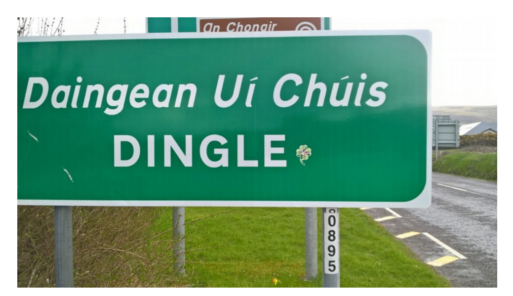
Figure One: Current Signage at the Entrance to Dingle/Daingean Uí Chúis

Ireland has experienced considerable controversy on the issue of linguistic dominance and place names relatively recently. In 2004 Éamon Ó Cuív, then Gaeltacht minister, changed the name of Dingle to an Irish equivalent under the Official Languages Act (Moriarty 2012; 2014; 2015). This effectively reversed the name from its English version to a more historical Irish name for the town. A plebiscite was held in 2006, which voted overwhelmingly for the name Dingle/ Daingean Uí Chúis. The National Roads Authority subsequently changed the signs in 2013 following legislation (see Figure One). It is particularly interesting in the context of the above discussion of the Anglo-American Cataloguing Rules that part of the ostensible argument against the Minister's name change to its original/equivalent was that it would be confusing for tourists, many of whom were American (Hickey 2013).