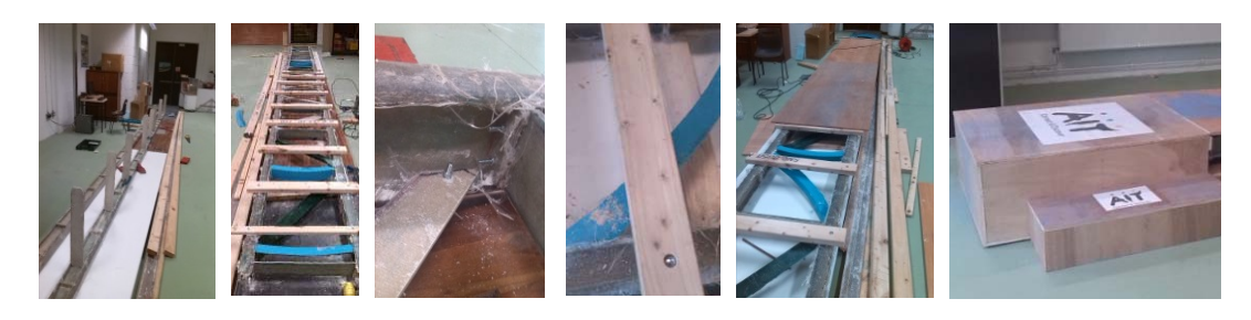
Figure 1. Construction of the Laboratory Scale FRP Composite Footbridge