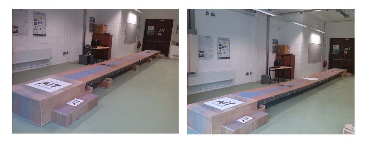
Figure 2. Completed Laboratory Scale FRP Composite Footbridge