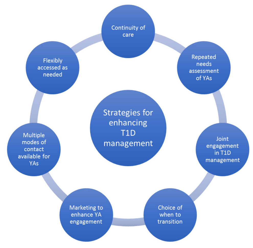
Figure 1. Themes emerging from expert panel discussions.

The development of the YAP resulted in meaningful involvement between young adults, researchers and service providers. The YAP made significant contributions to all aspects of the study development, in particular developing the qualitative interview topic guides, the participant invitation letters, consent forms and information sheets, and disseminating study findings'