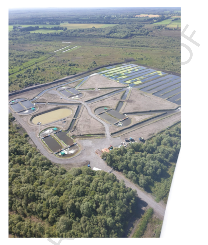
FIGURE 1.4 Aerial view of 'AquaMona' peatlands freshwater aquaculture RAS process in Irish Midlands.

sap from birch trees as it is rich in natural nutrients and low in sugar with a view to marketing as a new health-promoting beverage. Bord na Mona states that "Birchwater is an electrolyte-replacing beverage, high in antioxidants and similar to coconut or maple water." Bord na Mona has approximately 8000 ha of naturally colonized birch trees on their raised bogs and is also using birchwater as new smart ingredients for cosmetics and personal care products. The use of aquaculture model has also been exploited to investigate potentially new disruptive immune-priming nutraceuticals, such as beta-glucans from yeast, along with microalgae extracts, for fish health that has been reported to have positive implications for the gut microbiome in fish (Carballo et al., 2019).