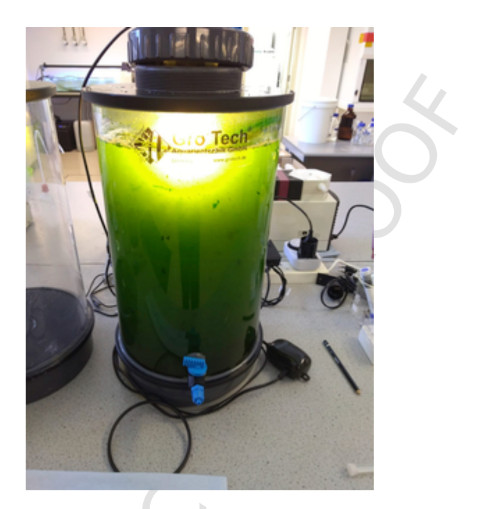
FIGURE 1.3 Bioreactor culture of microalgae used in freshwater aquaculture industry in Ireland.

ucts that we are very familiar with, such as yogurts and sauerkraut. This offers a more efficient, innovative approaches to producing the same proteins that we are already familiar with (Medical ExO,2020). The demand for such alternative food ingredients has been pushed by Millennials and Generation X with changes in eating habits (Chapter 5) along with commensurate changes in personalized nutrition. From the disruption of introducing Greek yogurt to the emergence of new functional foods such as seaweeds (Mohamed, Nadia, Hafeedza, & Rahman, 2012), there has been increasing interest in food ingredients. Such things have informed a trend toward personalized nutrition. Considerable development in this space has been the recent partnership of Nestlé with Corbion. This combines exciting expertise of Corbion's microalgae innovation with Nestlé fermentation abilities that is renowned for its smart plant-based products. Another example, include Impossible Foods, who are making soy heme (typically found in soy plants) for plant-based burgers through microbial fermentation. Impossible food burger is made with soy leghemoglobin that mimics the taste of meat. Such innovations in food ingredients may also complement growing consumer demand for eco-sustainable food sources, which also reflects changing eating habits, diets, and the