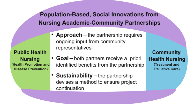
Fig. 12.2 Principles for population-based nursing-academic community partnerships

outcomes (Grimm et al. 2013) in both branches of population-based nursing (i.e., community health and public health nursing). Nursing academic partners frequently held multiple roles including as project initiators, providers and evaluators of the social innovations. The nursing academic frequently was the initiator of the partnerships and used a systematic approach that not only ensured that community representatives provided input, but also that the community input was incorporated into the social innovation project. Moreover, most social innovations had identified benefits for both partners (i.e., the nursing academicians and the community members); however, in contrast, very few social innovations had successfully developed a formal feedback loop ensuring sustainability of the partnership or the project.